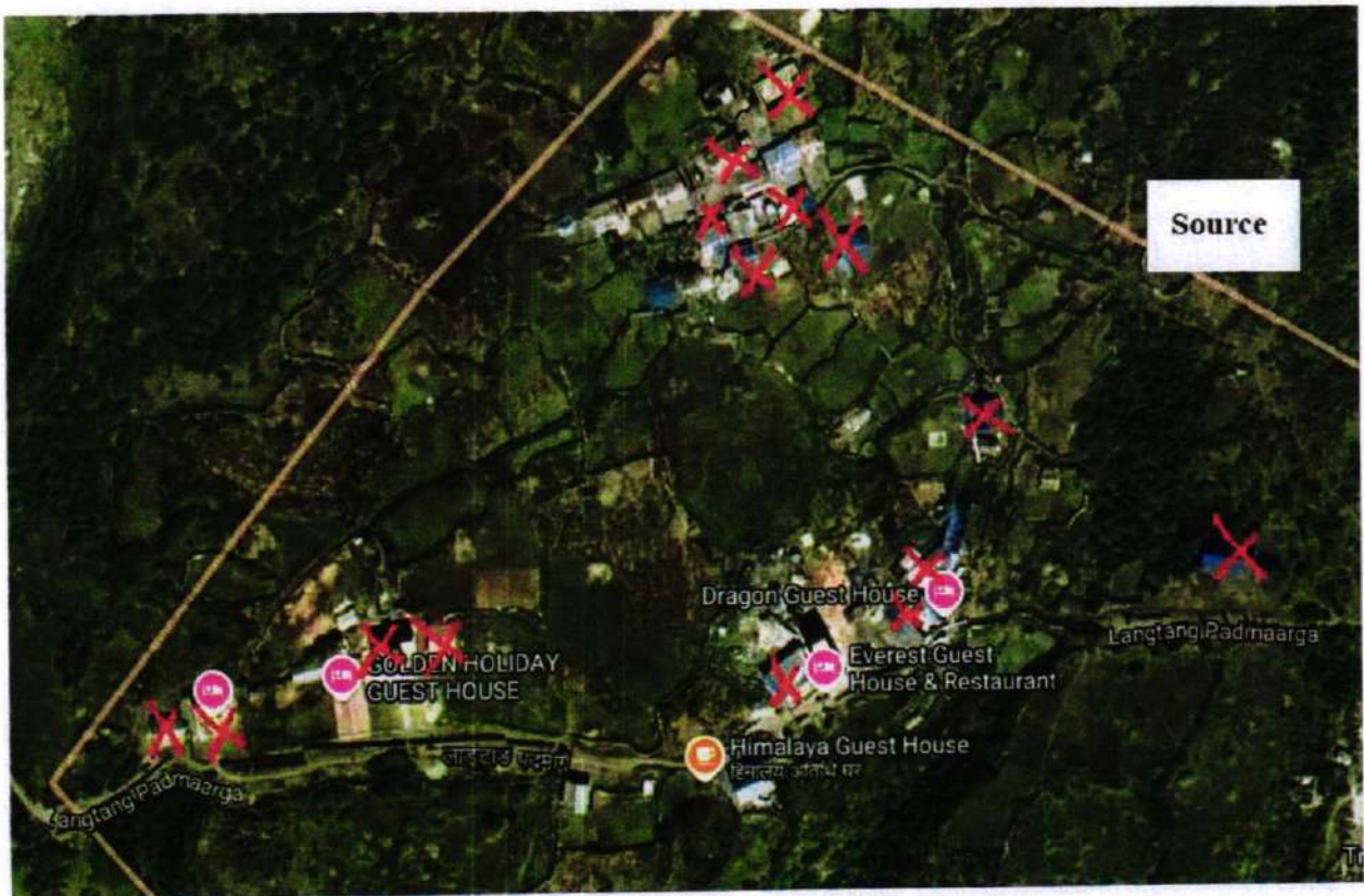
Figure 2. Map for Question 1 (b)